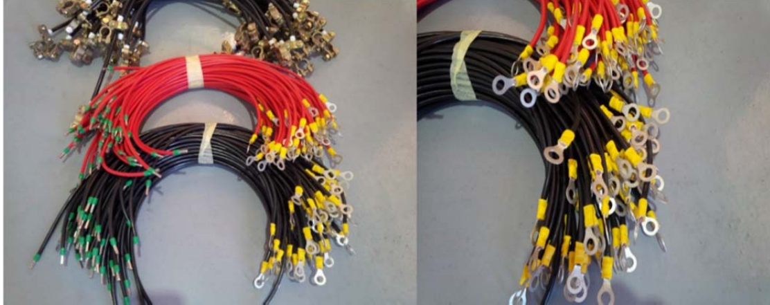
Solar regulator wiring kits